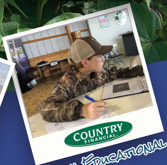
YOUTH EDUCATIONAL CHALLENGES

These individual contests test student knowledge in 5 areas. In addition, students will be able to challenge their ag teachers...who has the most ag knowledge? Participants receive a meal sponsored by Agri-Supply and Coca-Cola.