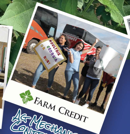
AG MECHANICS CONTEST

This individual event allows students to create and submit intricate and technical masterpieces that are judged and then displayed during the Expo for the public to see.